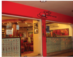
Cafe Qahwa, SDA Market, IIT