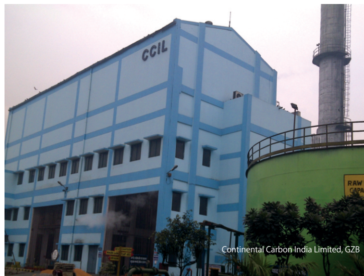
Continental Carbon India Limited, GZB

At J3DE each project with its diversity, challenges and opportunities makes us walk a new path that stimulate our curiosity and creative thinking. Therefore each project is approached as a new original territory without pre-conceived notions or ideas. The J3DE team brings together a special blend of talent, discipline through technical expertise and instinct that brings success to the project. We at J3DE work with a user-centric philosophy, based on listening to our clients and providing innovative solutions, on schedule, within budget. We encourage continuous client-user participation throughout the project life. This helps foster productive interaction and build strong relationships. Our approach to design is tailor made to the owner's program, scope, timeline and budget. Good design is truly innovative, eminently sensible and source of inspiration for those who have the pleasure of living, working or just experiencing it.