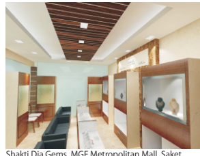
Shakti Dia Gems, MGF Metropolitan Mall, Saket